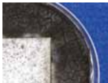
Others without Microban protection

*Warranty applies to residential applications only. See full warranty at www.alliedair.com for terms, conditions and exclusions.