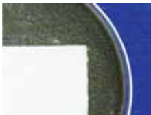
Armstrong Air with Microban protection

You will enjoy cleaner air with Microban-infused drain pans that inhibit the growth of mold and mildew. So you enjoy a healthier environment year after year.