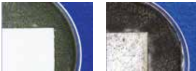
Armstrong Air with Microban protection

You will enjoy cleaner air with Microban-infused drain pans that inhibit the growth of mold and mildew. So you enjoy a healthier environment year after year.